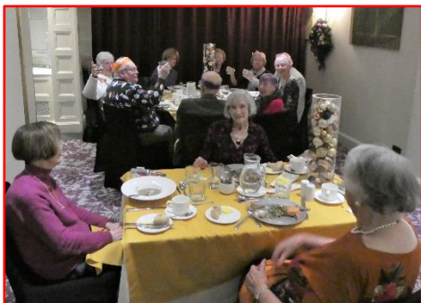
Christmas Lunch at Barton Grange Hotel