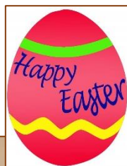
Easter Messy Church