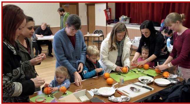
Jan '16 Messy Christingle