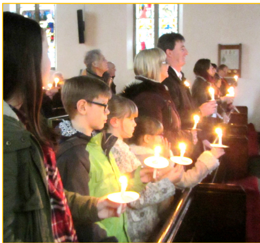
Christingle: morning & afternoon services