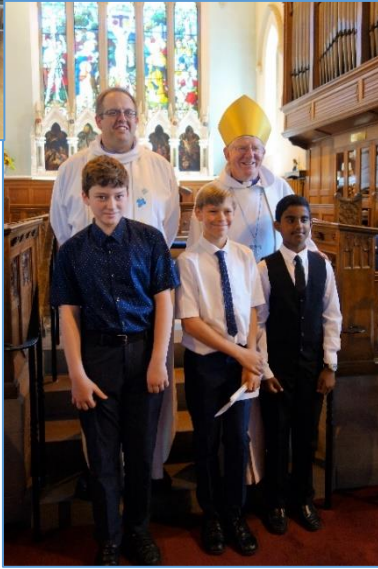
The Pathfinders who led our July Café Church, followed by . . MESSY Sports