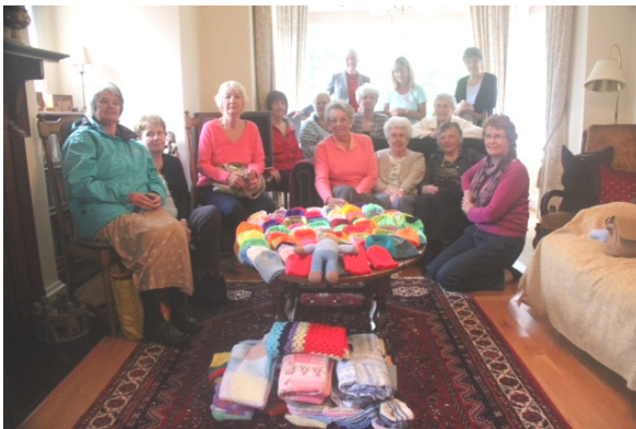
Crafters with their hats for babies in Africa (Pg1)