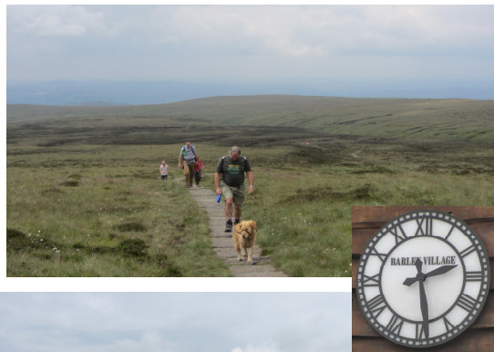
Church Walk up Pendle