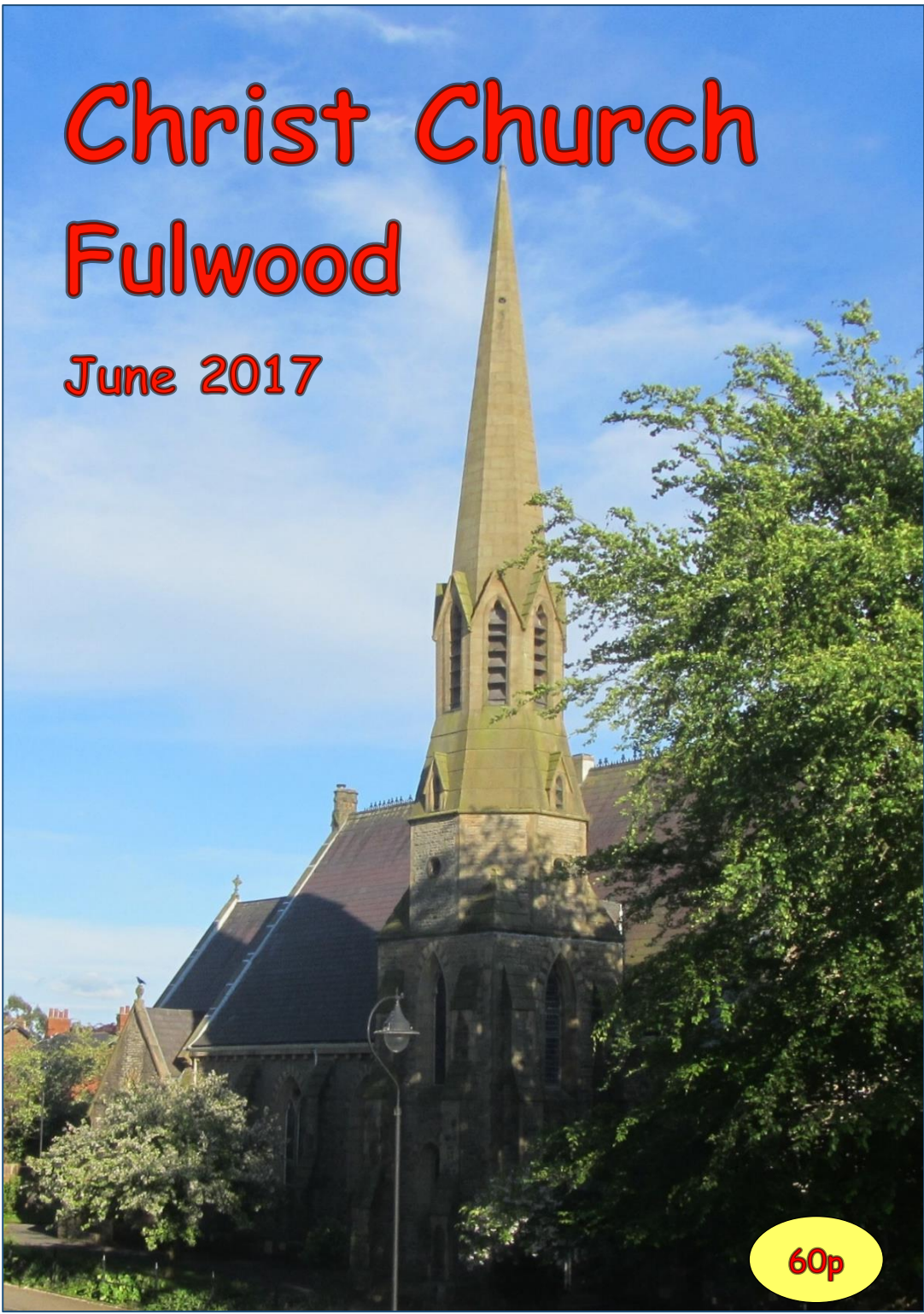
Christ Church Fulwood June 2017