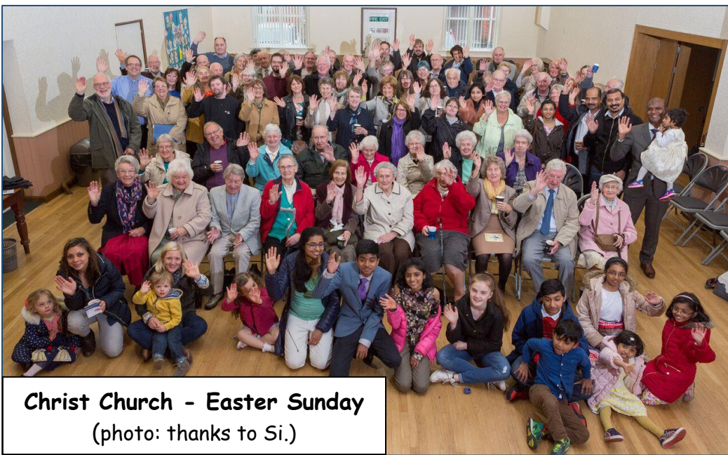
Christ Church - Easter Sunday