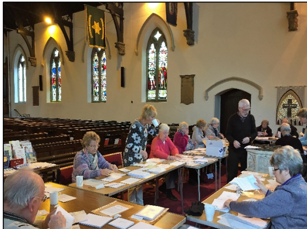
Photo: (in March) some of those who helped collate the Data letters ready to send them out to the parish - thanks to all involved.

There are, however, still some outstanding: if you haven't yet returned yours (it was delivered to your home just before Easter) please complete and return it as soon as possible. If you need another form just contact the parish office: 875823.