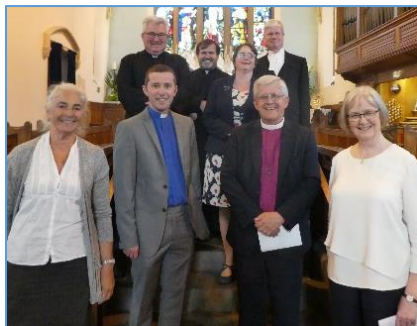
The Induction Service